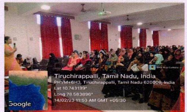
Totally 103 Students were actively Participated.