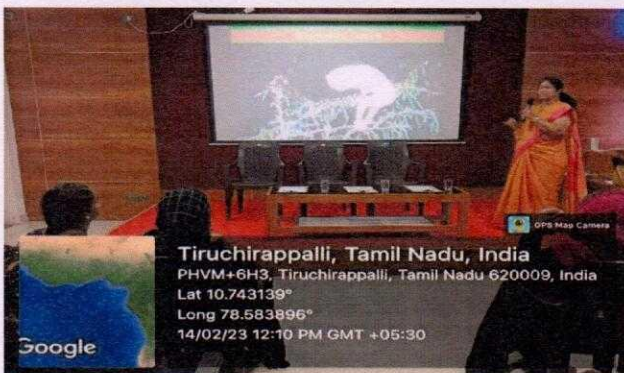
The speaker explained about Wild life and Vegetative in the slide.